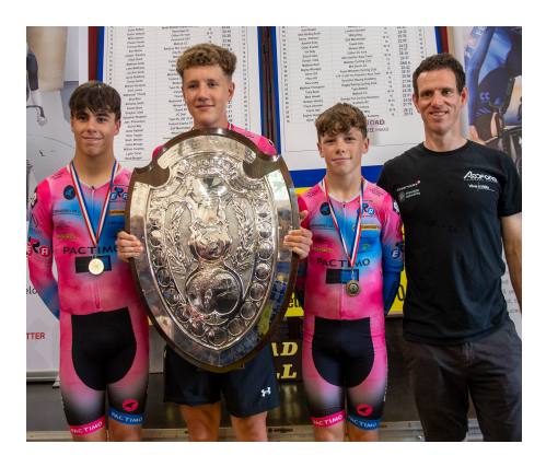
Team - Evolution Racing Academy